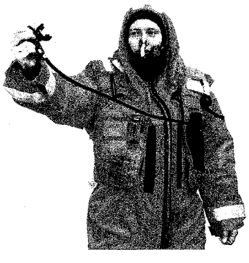
3 Pull second stage regulator clear of its dustcover and the hose clear from suit Velcro.